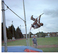
Fig. 1. A pole vault event.